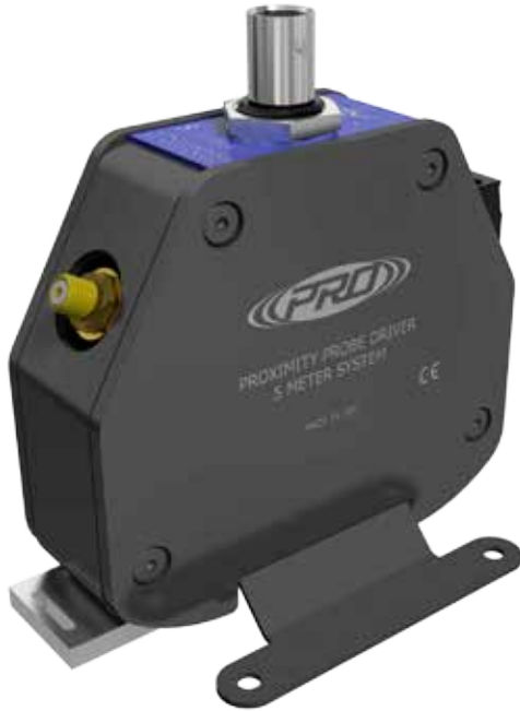
Panel Mount Option (Shown Above)

BENTLY™ 3300/3300XL COMPATIBLE 8 mm , 4-20 mA Output, Driver Assembly