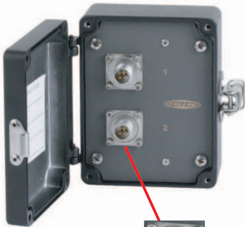
4 Pin Output for Interface with J4 Series Connectors