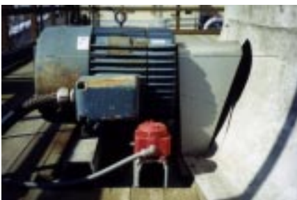
Figure 2. Cooling tower motor

Now, however, Bristol-Myers Squibb has seen the implementation of a programme to monitor the inaccessible machine components of cooling towers by permanently mounting low-