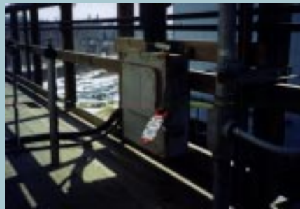
Lock-out of cooling tower fan during accelerometer placement

Safety Considerations . Safety is paramount at Bristol-Myers Squibb. The Safety Department requires certain Protective Personnel Equipment (PPE) for all employees, contractors, or visitors working or visiting in pre-designated hazardous areas. For the jackshaft driven cooling towers, a Confined Entry Permit was required prior to accessing the cells for collection of data on the gearbox and fans. special cleats were needed to ensure secure footing on the wet catwalks. Harnesses were required to be worn by the vibration analyst while in the cooling tower cell to reduce the risk of injury if footing was lost. Hard hats and protective eye-glasses were also required to ensure the safety of the analyst. Additionally a second person was required to be present while the analyst was inside the cell to ensure the analyst's safety. Finally, the analyst, to prevent a premature startup of the cooling tower fan, locked out the cooling tower cell prior to the entry into the cell (see figure below).