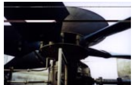
Figure 3. Cooling tower gearbox and fan

Since the motors are easily accessible to the vibration analyst at Bristol-Myers Squibb, portable measurements (via magnet-mounted accelerometers) are utilized effectively to monitor the condition of the cooling tower motors. Motor unbalance, rotor bar defects, output shaft alignment and bearing defects are typical faults that are monitored.