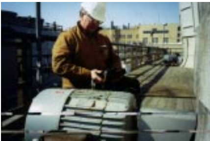
Figure 5. Portable Collection of Vibration Data from Cooling Tower

detached and damage the cell and the surrounding components. In search of a cost-efficient, timesaving alternative, Bristol-Myers Squibb and CTC (an accelerometer and vibration analysis hardware manufacturer) together investigated efficient alternative means to portable measurements. For the initial three jack-shaft-driven cooling towers, a system of low cost accelerometers mounted to mounting targets and connected to a remotely-mounted switch box was specified after consideration of a number of different issues.