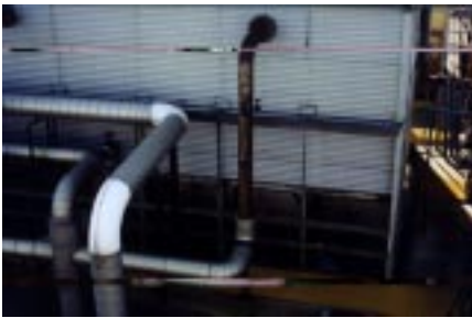
Figure 4. Cooling tower pool (located under the tower structure)

detached and damage the cell and the surrounding components. In search of a cost-efficient, timesaving alternative, Bristol-Myers Squibb and CTC (an accelerometer and vibration analysis hardware manufacturer) together investigated efficient alternative means to portable measurements. For the initial three jack-shaft-driven cooling towers, a system of low cost accelerometers mounted to mounting targets and connected to a remotely-mounted switch box was specified after consideration of a number of different issues.