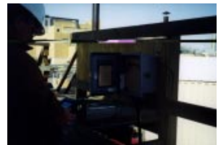
Figure 8. Accessing data from the switch box