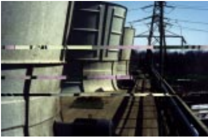
Figure 1. Cooling towers at Bristol-Myers Squibb

The installation of low-cost vibration hardware for monitoring inaccessible cooling tower components has proved to save Bristol-Myers Squibb time and money. Here they give Machine Plant and Systems Monitor the full story.