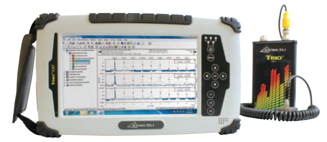
TRIO CX7 tablet, data processor and triaxial vibration sensor

TRIO™ has arrived and is demonstrating that there is a better way to implement machine condition monitoring. TRIO is more than a vibration data collector; it is a powerful computerized system in a mobile industrial package that sets aside the traditional data collection model and brings forth a new focus on ergonomics, efficiency and safety. TRIO will improve the effectiveness of your condition monitoring program and will allow you to get more done in less time with a high degree of success while lowering the overall cost of your program.