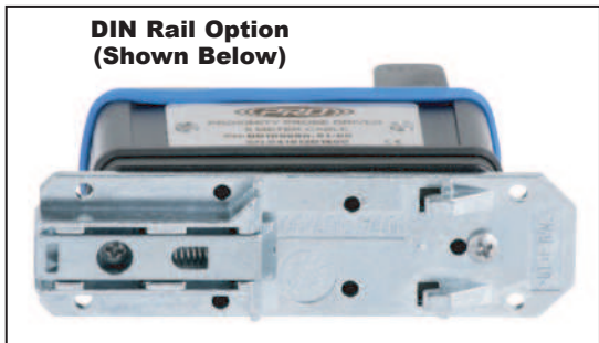
DIN Rail Option (Shown Below)