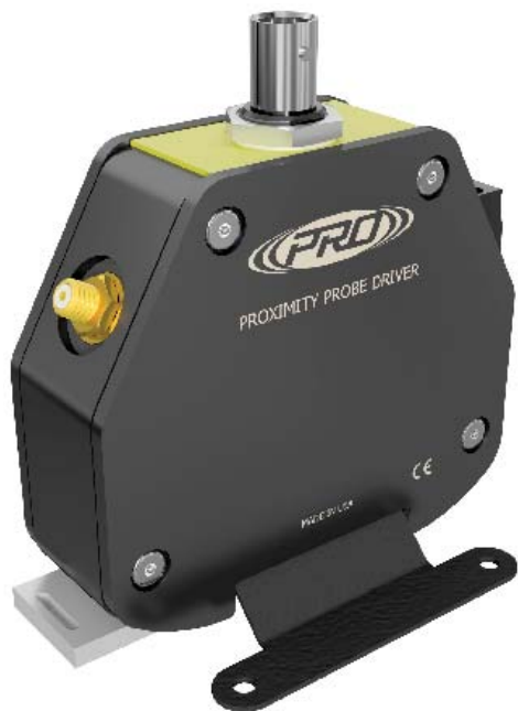
Panel Mount Option (Shown Above)